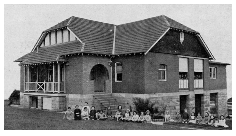
"DUNKELD", the third Burnside home

The school is located a 1 Masons Drive, North Parramatta, a short walking distance from the Burnside Homes.