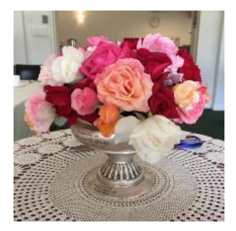
Rose bowl displaying flowers from the Club's gardens