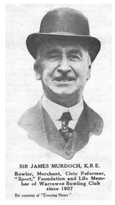
This portrait appeared on the cover of "Bowling Life", 29<sup>th</sup> August 1928

As a result, he had fewer labour problems, greater efficiency and greater retention of workers.