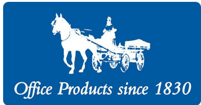
W. C. Penfold promotional material

Acknowledgements: Ku-ring-gai Historical Society