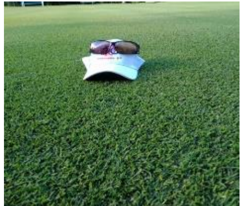
Open day 3/20

The 8 week renovation involves: dropping the cut height for easier scarifying followed by coring, fertilizing (full of goodness), then 15 tonnes of top soil, more fertilizing, laser levelling, more fertilizer, a final top dressing then watering, mowing and rolling until such time the lawn is flat-as-a-tac and running at an ACA competition speed of 11 to 13 seconds and once again looking like carpet and at its best. Well worth the wait and an experience.