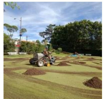
Laser levelling the lawn (1/20)

We had been winning with the moss up along the northern end of the Lawn but with the recent consistent rains it has reared again, follow up treatments will be completed. Weeds have invaded the lawn over the last few weeks; we have sprayed the green and banks with a selective herbicide, the weed seeds blow into that area from the Pacific Highway.