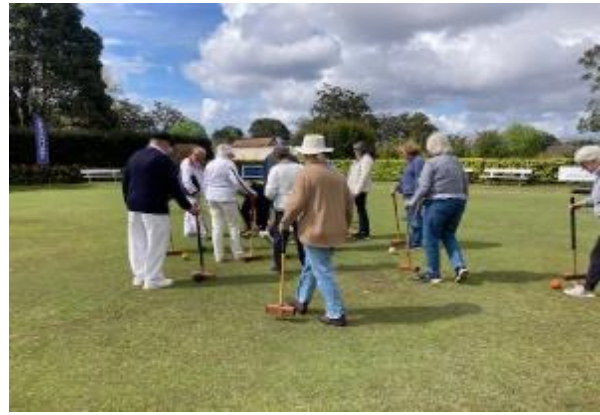
Finalists gathering around for the results of the spider