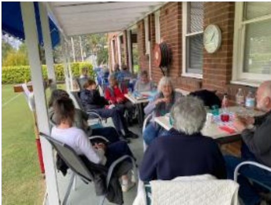
Members enjoying lunch on the verandah