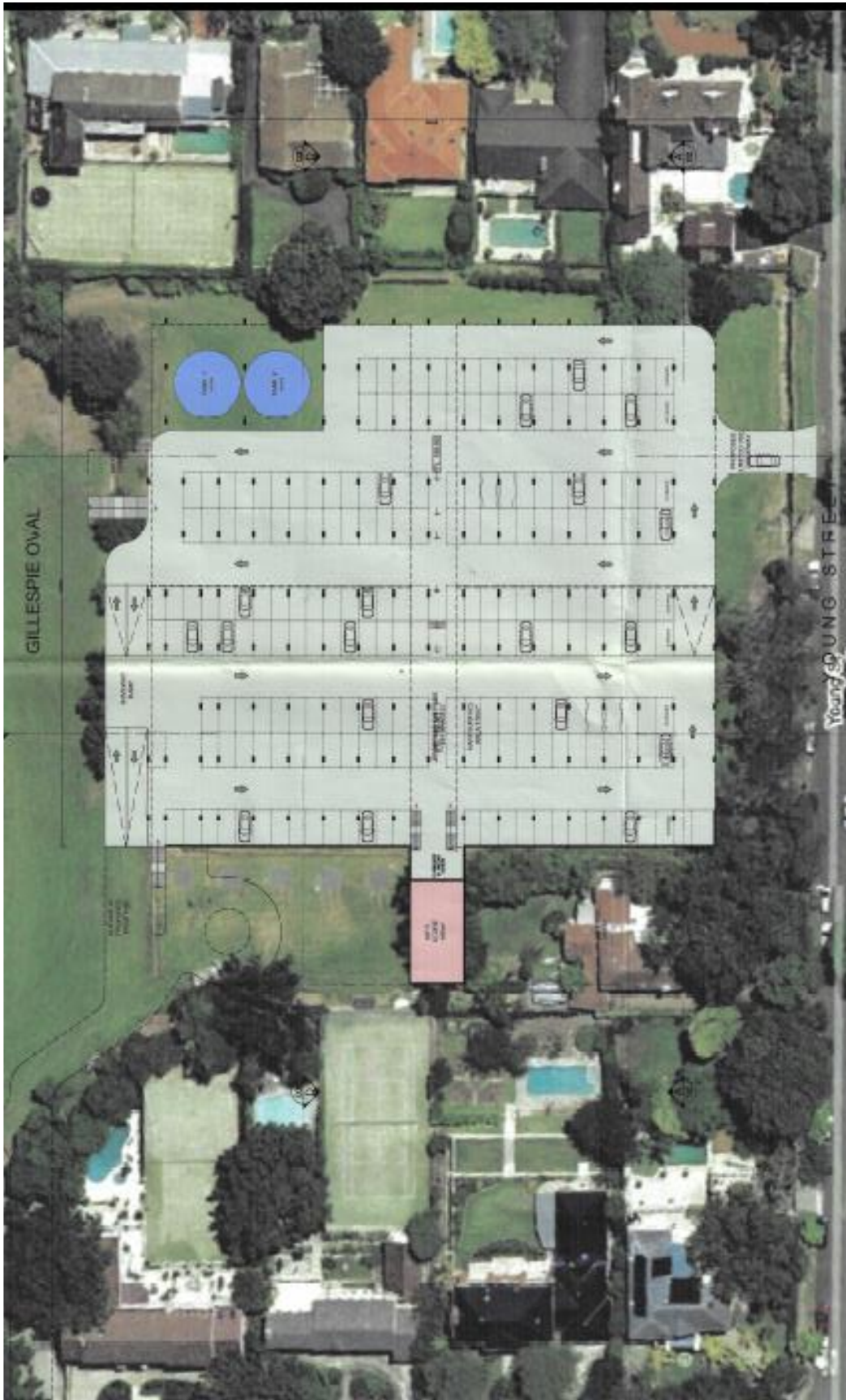
CAR PARKING LEVEL