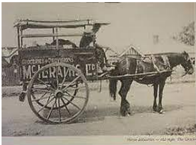
Home deliveries 1918