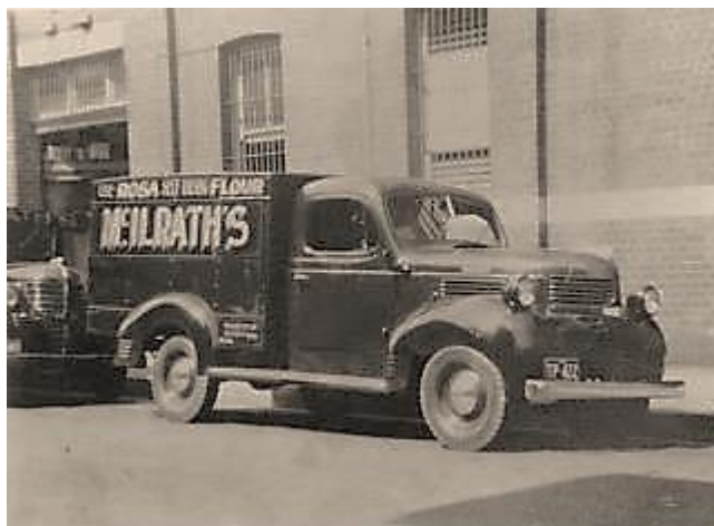
Home deliveries 1948