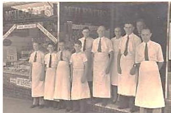
McIlrath's grocery store in Five Dock in 1950

I remember my mother doing her grocery shopping at McIlrath's in Mosman in the 1950s. It was just across the road from where our family lived, in a flat above a shop in Military Road.