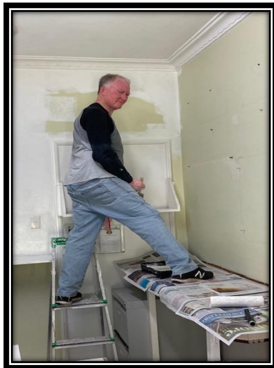
A painter that wears Nikies must be good

That's all from the Croquet hut till next time. Enjoy the holiday with your family and friends, and we will see you in two weeks on a croquet lawn that is recognised as one of the best lawns in Sydney.