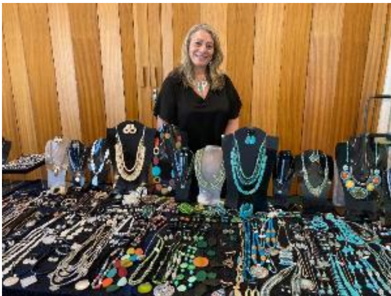
The Jewellery Lady with a beautiful array of jewellery