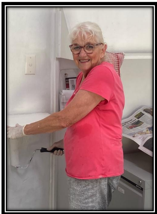
I don't do ladders