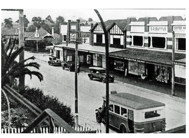
Gordon Road at Lindfield Railway Station