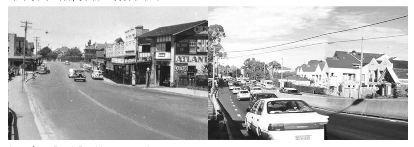
Lane Cove Road, Pymble 1950s and now