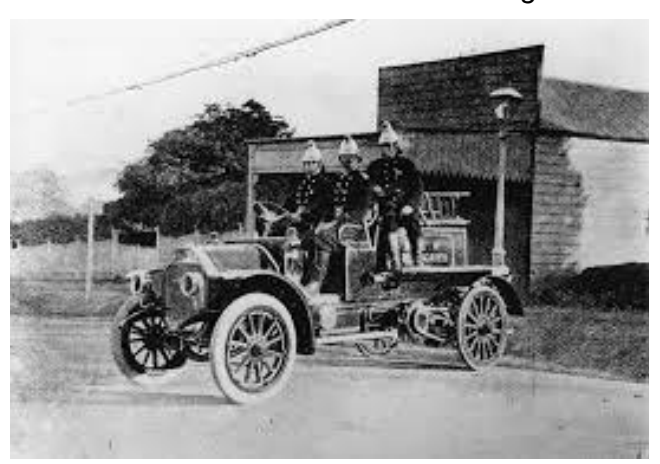
Fire Station at Pymble (still there)