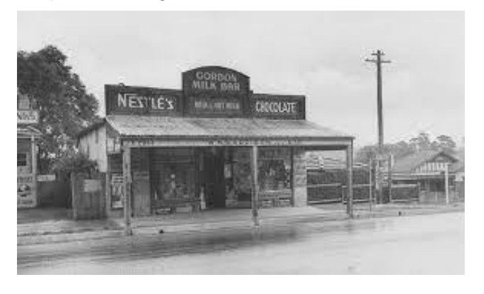
Milk Bar in Gordon