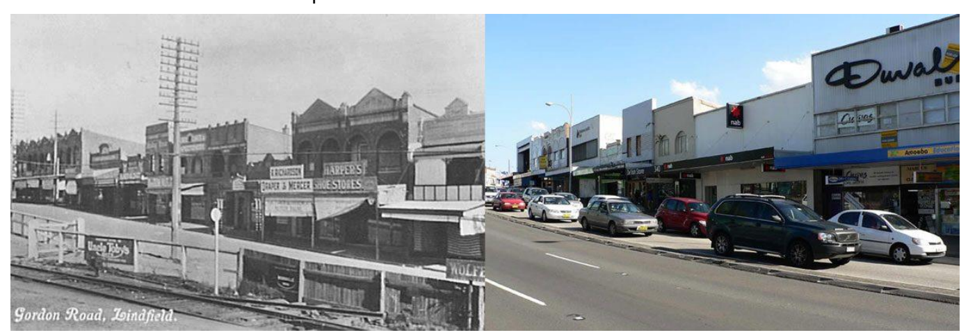
Gordon Road, Lindfield in the 1920s and now

Below are some before and after photos of sections of this road.