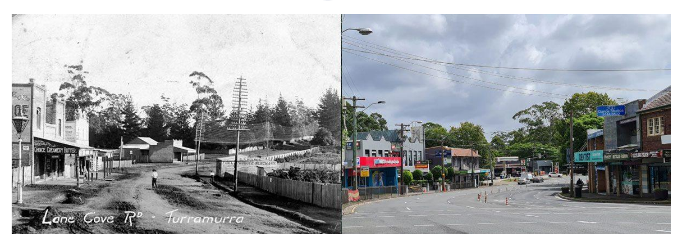
Lane Cove Road, Turramurra early 1900s and now