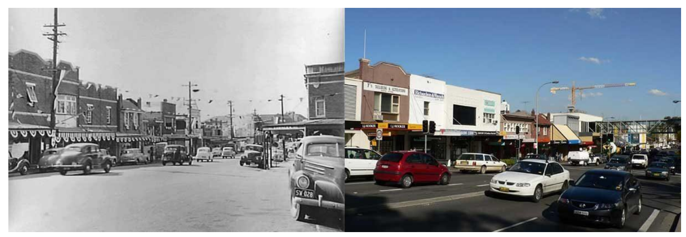
Lane Cove Road, Gordon 1950s and now