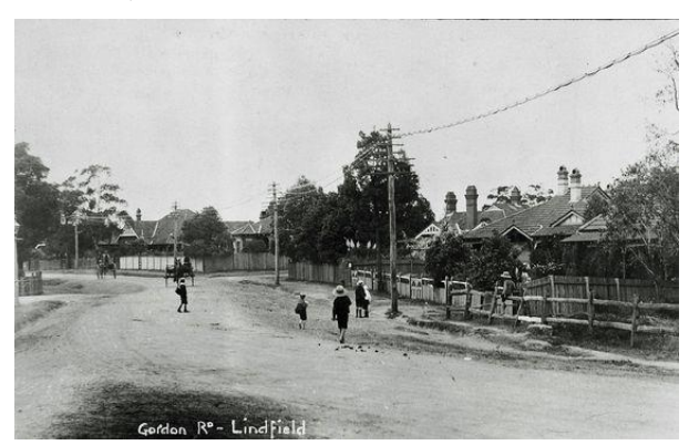
Gordon Rd,Lindfield in 1910. Taken looking north with Strickland Ave on the right

However, Lane Cove Road remained. Below are more photos along this road.