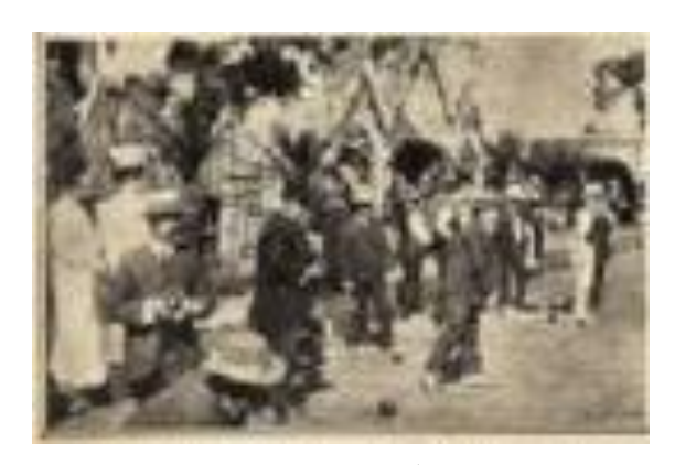
Bowls at Sandy Bay – 1<sup>st</sup> January 1845 (excuse the grainy photo)

The first recorded game of bowls in Australia took place in Sandy Bay, Tasmania in 1845, on a newly constructed green at the rear of the Beach Tavern.