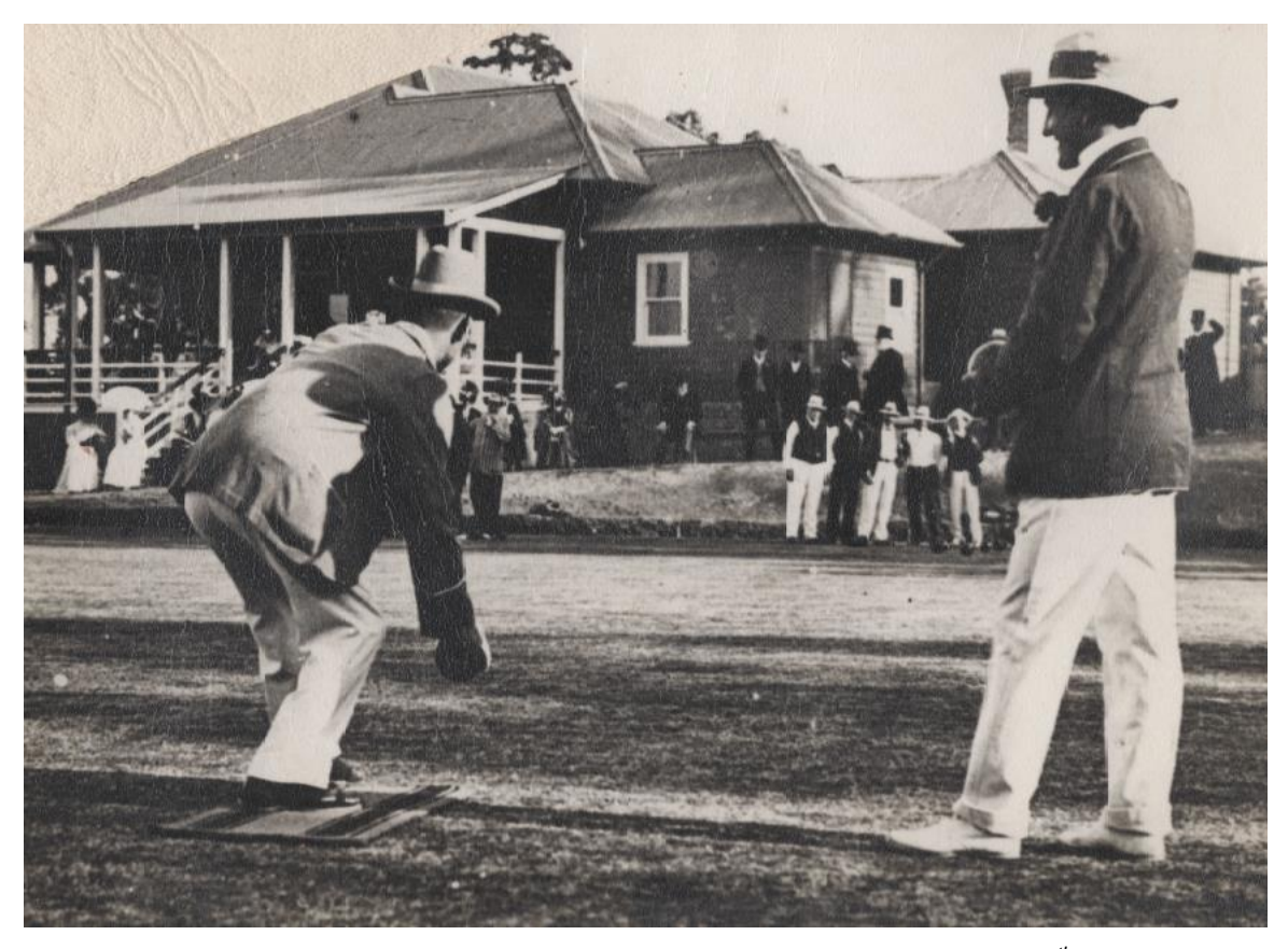
The first roll-up, at the official opening of the Ku-ring-gai Recreation Club on 7<sup>th</sup> September 1907, later to be renamed as the Warrawee Bowling Club. (Played on A Green, later the Croquet Lawn)