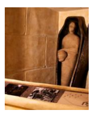
An ancient Egyptian, buried with his favourite bowl (even the bowl looks mummified)

The game was particularly popular in the 19<sup>th</sup> Century when Britain was colonising the world, so it was inevitable that they would take it with them to the colonies.