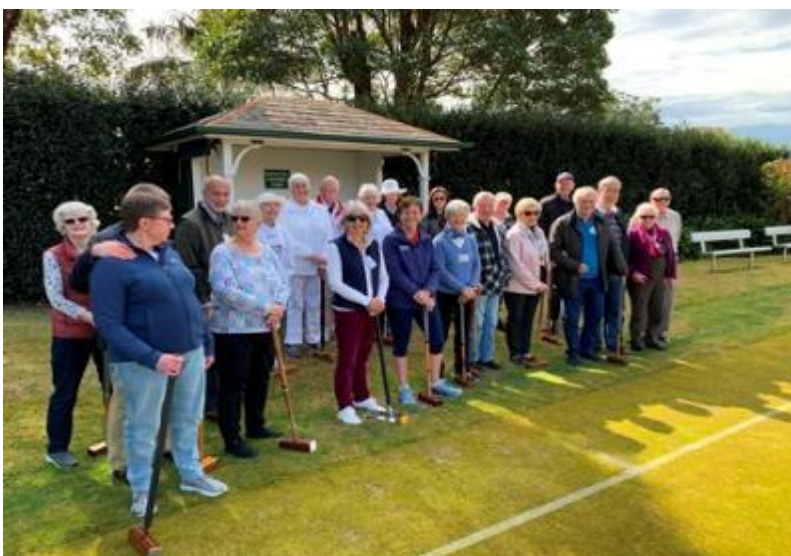
Group photo of participants from D'Caf and Club volunteers