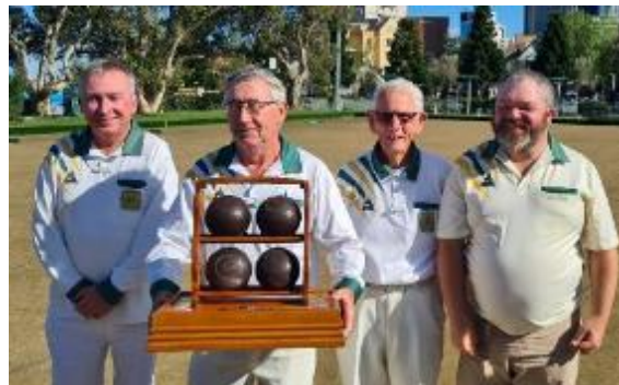
Killara – the winning team