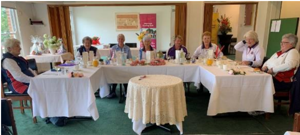
The official table