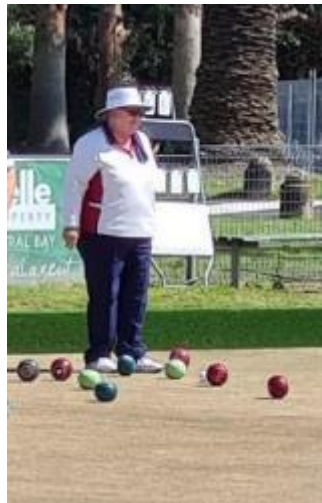
Peg directing the head