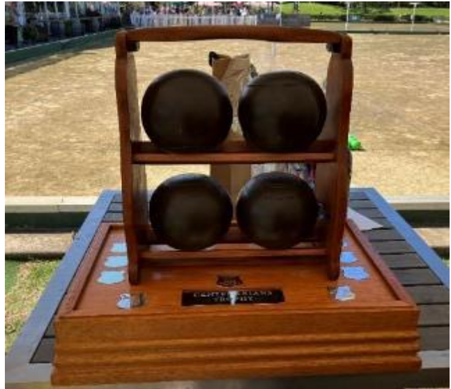
Centenarians Trophy an antique set of bowls made from timber (lignum vitae)