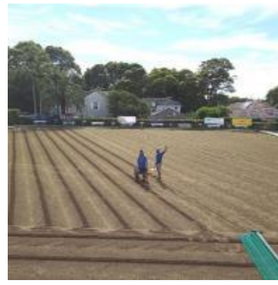
'C' green renovation, removing the waste material manually after scarifying)