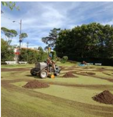
The trees overshadowing the lawn, lawn renovation - top dressing and Laser leveling all in one

Weather permitting, the usual eight weeks have been allocated to complete the renovation; enabling for the lawn to be back in play on the 19 th February. This allows time for coaching and training of our GC Pennant players before the start of the 2023 Pennants season in early March '23.