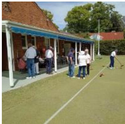
The veranda roll-up awnings to be replaced